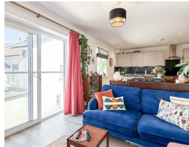
KITCHEN/ LIVING ROOM